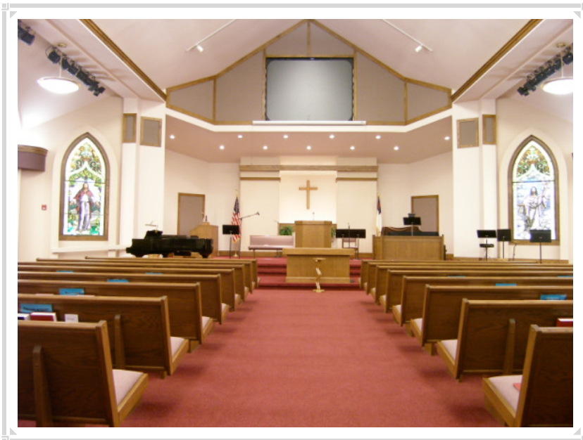
Our sanctuary has a 6ft wide center isle, perfect for the wedding precession.

Noelridge Christian Church offers beautiful and spiritual surroundings for your wedding day. Our fellowship hall is available for rehearsal dinners and receptions. All weddings come with a wedding coordinator who will guide you as you plan your special day.